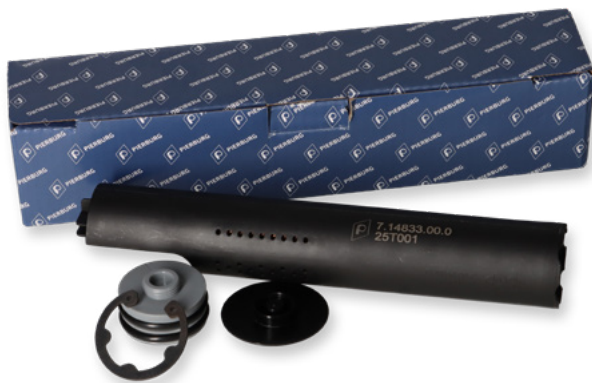
Filter dryer with accessories (item no. 7.14833.00.0) for Tesla

Motorservice has a service kit consisting of a filter dryer and accessories (item no. 7.14833.00.0, OE reference 1597579-A0-A) for Tesla's refrigerant circuit is included in its aftermarket range. With the filter dryer, Motorservice covers more than 3.7 million vehicles from the electric vehicle manufacturer worldwide.