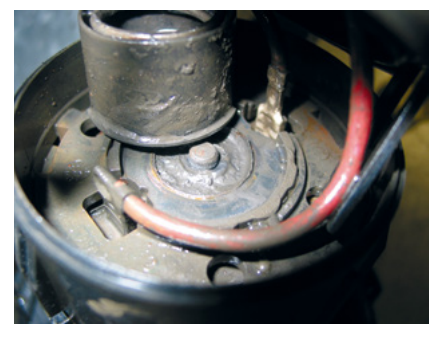
Corrosive exhaust gas condensate in the drive motor of a secondary-air pump