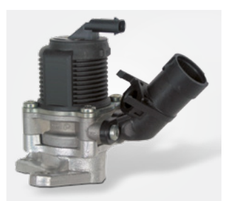
Solenoid Secondary-air valve (since approx. 2007)