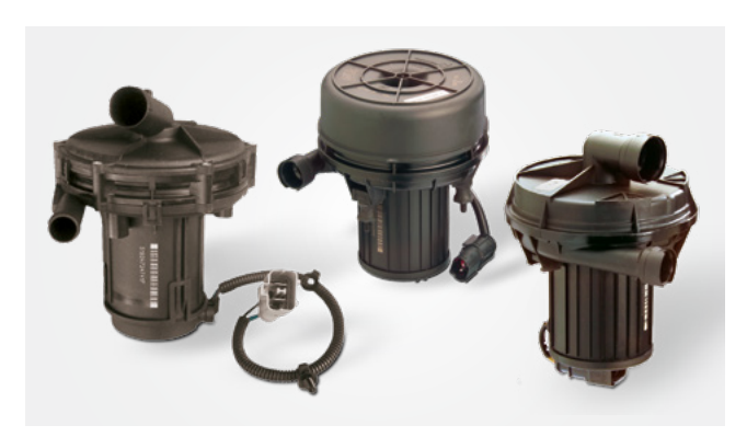
Various 1st and 2nd generation secondary-air pumps

Solenoid secondary-air valves may be equipped with an integrated pressure sensor for on-board diagnosis (OBD) monitoring.