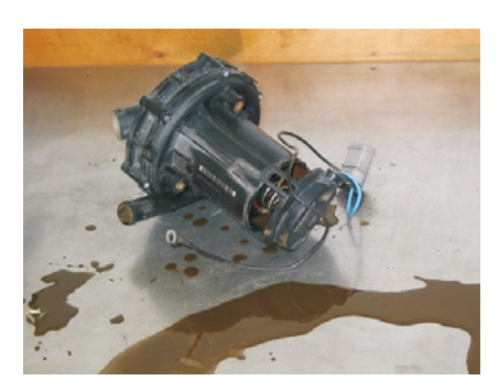
Liquid exhaust gas condensate from a secondary-air pump