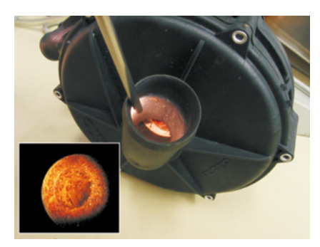
View of the corroded inlet of a secondary-air pump