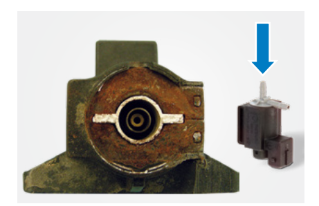
Corroded switchover valve (open)