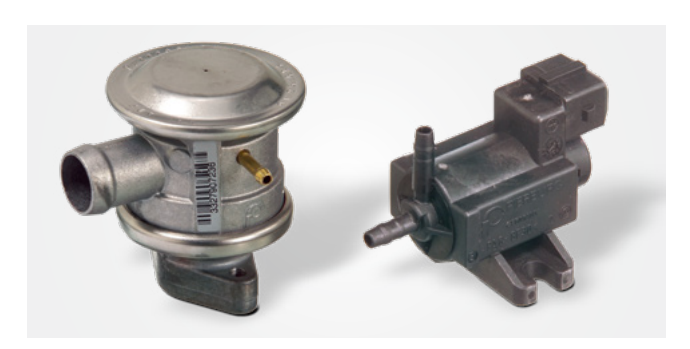
Vacuum-controlled valve with shut-off and non-return function (since approx. 1995) and solenoid switching valve