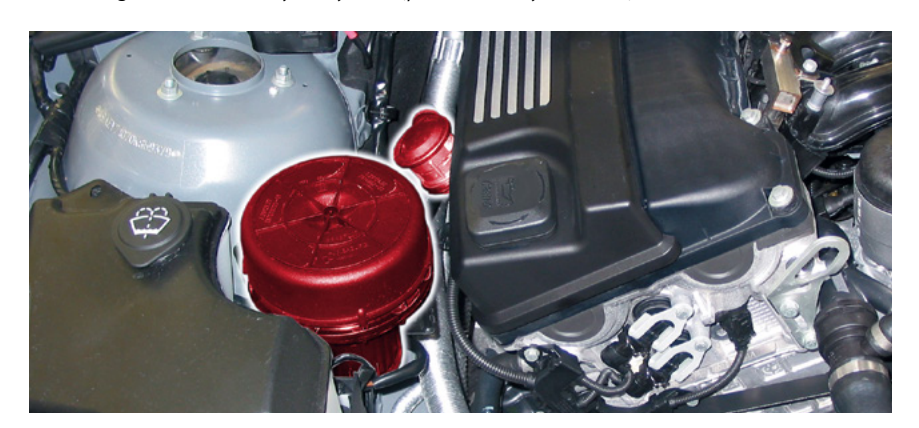
Secondary air valve and secondary air pump in BMW E46 (highlighted)

Block diagram of secondary air system (pneumatically actuated)