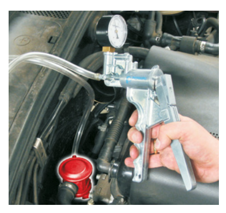
Checking a secondary air valve with a vacuum hand pump