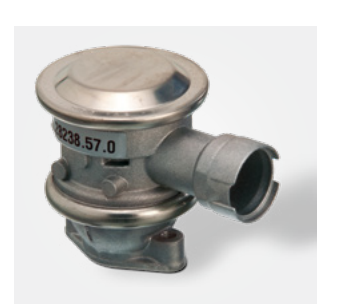
Pressure-controlled valve with shut-off and non-return function (since approx. 1998)