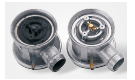
Open secondary air valve Left: Damage caused by exhaust gas condensate Right: New condition

Check the connection for leaks and re-seal if necessary.